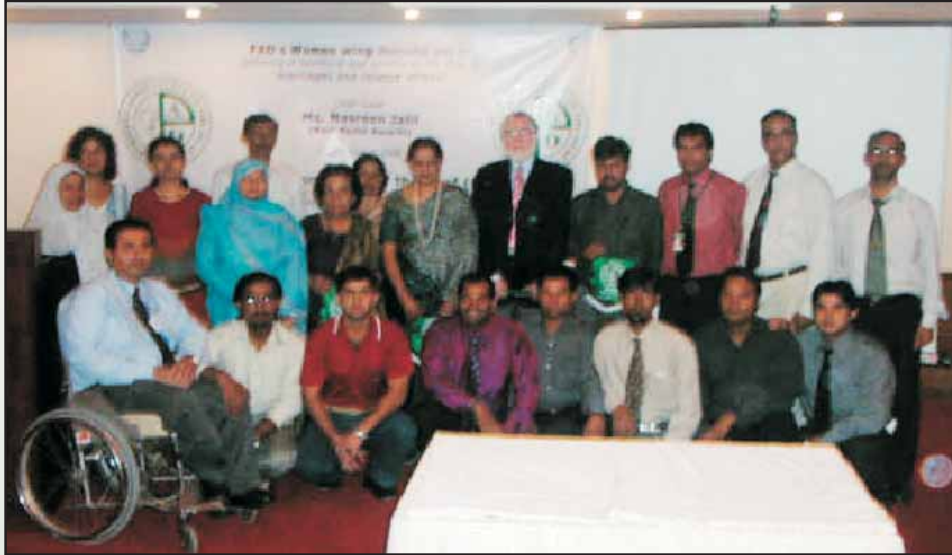
PAD's Women Wing Organized a gathering of deaf's families on the issue of "Marriage of Deaf Persons & Related Affairs".