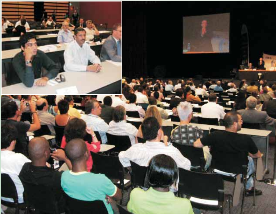
15th World Congress of WFD in Spain