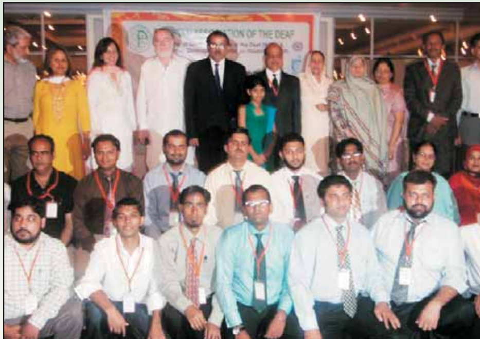
Get-together of Hearing Impaired Persons (Deaf) & their Special Friends