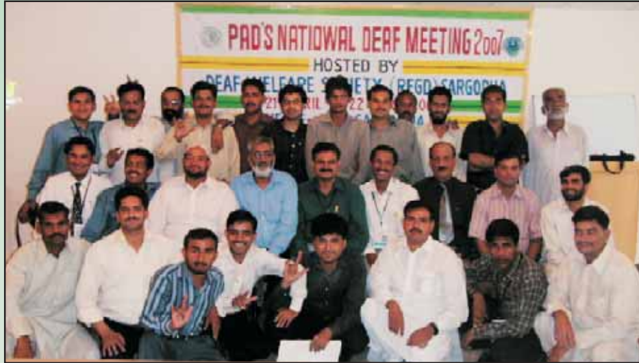
First Conference & Meeting from Sargodha Deaf Association in 21-22 April 2007