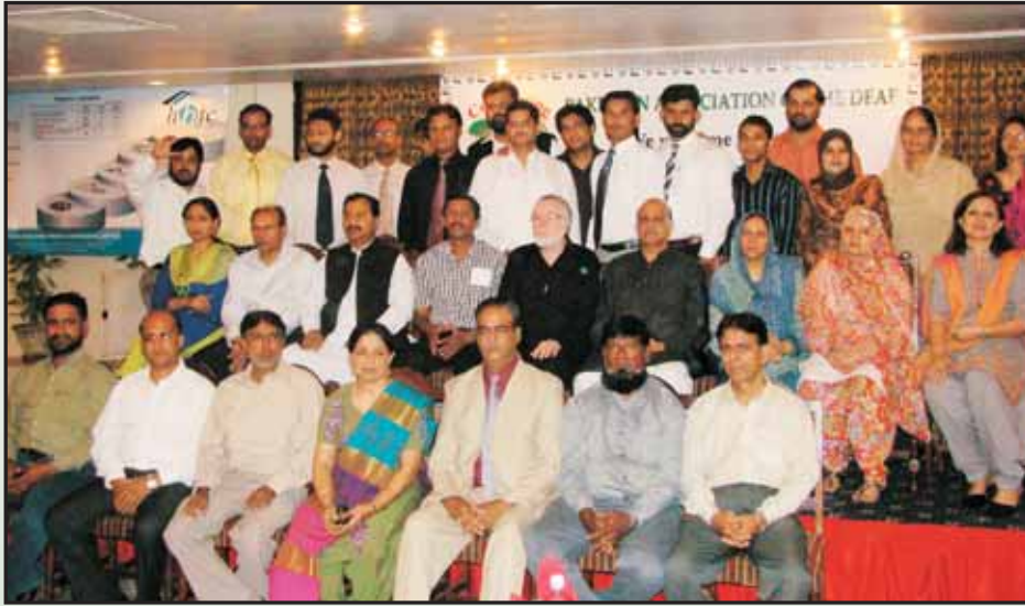
Celebrating 20th Anniversary 20 years of Passion, Dedication, and Commitment