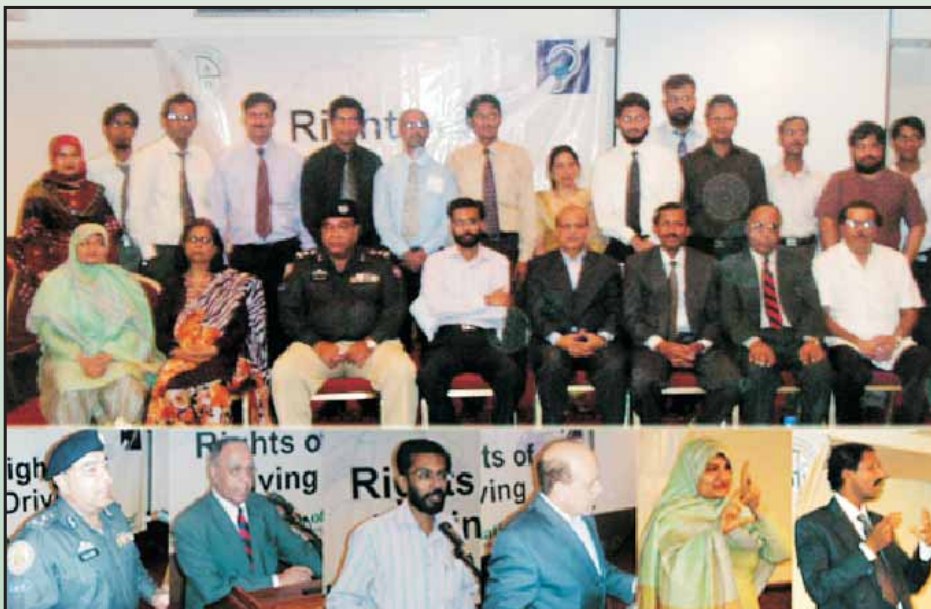
"Driving License for the Deaf" Government and Deaf Community face to face